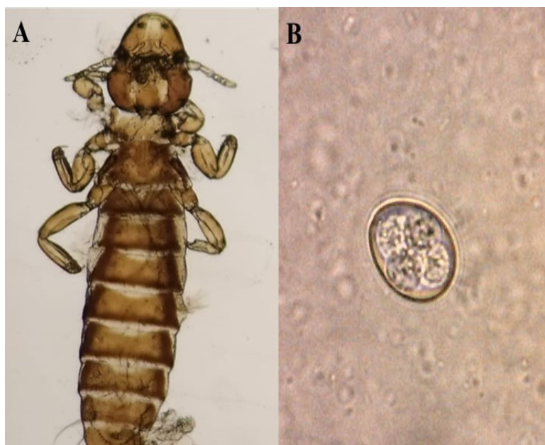
Figure 1 – Specimens of endo and ectoparasites found in N. hollandicus from different breedings. A: Louse of genus Neopsittaconirmus , observed in an estereomicroscope. B: Oocyst of genus Eimeria observed in microscope, 40x magnification.

In all breeding sites the cages are cleaned weekly, daily water exchange and, except birds of the third breeding, the other cockatiels had already been submitted to fecal exams and to the subsequent antiparasitic control about one year before the assessment. This factor may be one of the causes of the birds of the third breeding having the highest occurrence of parasites regarding to the others. Two breedings presented positive result for genus coccidia Eimeria in at least one fecal sample of N. hollandicus . The genus of coccidia was identified through oocyst morphology and host type where it was found. Sprenger et al. (2017) also found Eimeria spp. in N. hollandicus , and it may indicate that this endoparasite is commonly found in this bird species.