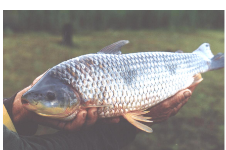
Leporinus macrophthalmus (piau-açu) Prochilodus lineatus (Curimatã)