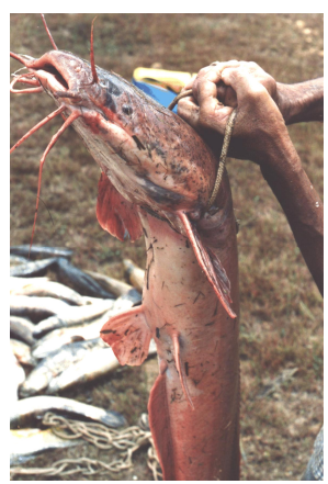
Clarias gariepinus (African Catfish)