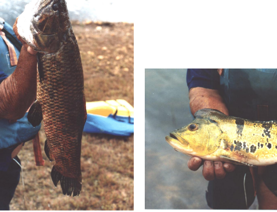
Cichla ocelaris (Tucunaré)