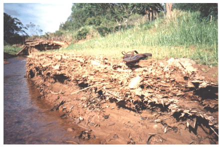
Sediment deposited in lake