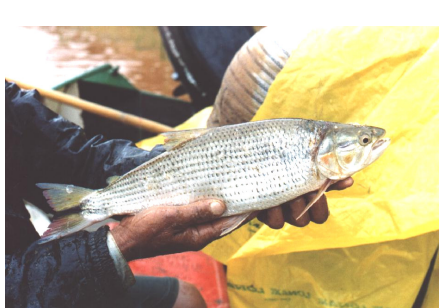
Salminus hilarii (Tabarana)