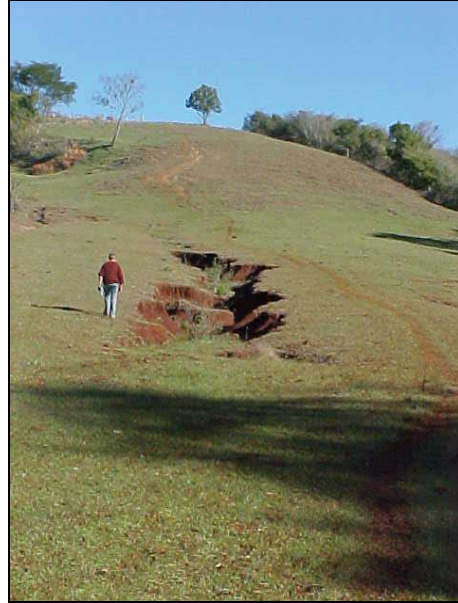
Picture 4 - Small gully over Inceptisol.