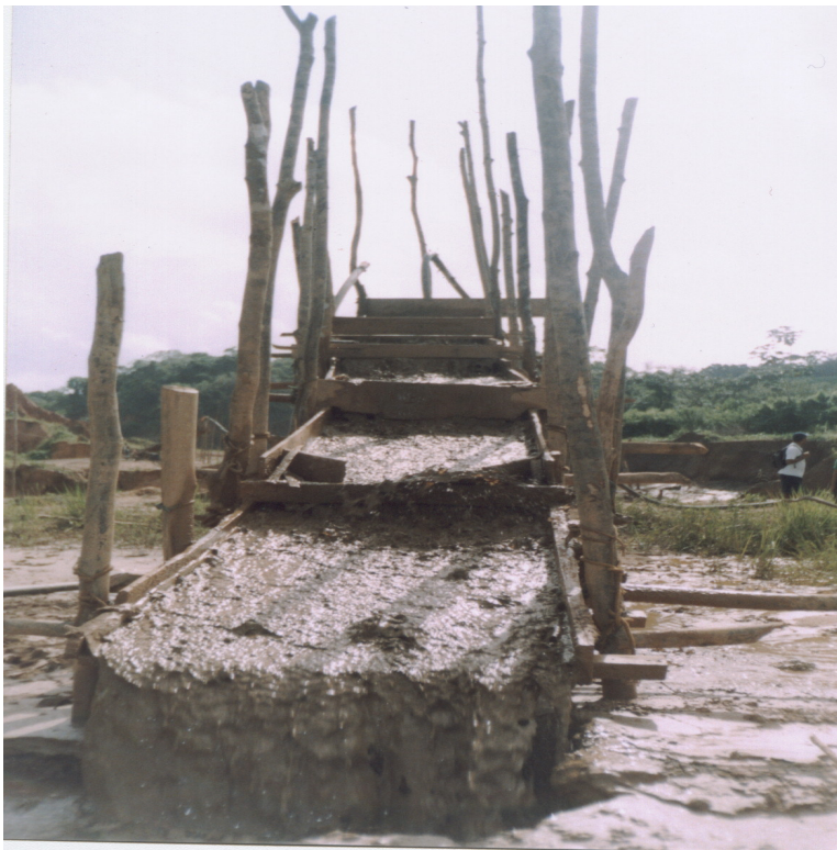
Picture 3- Concentration box