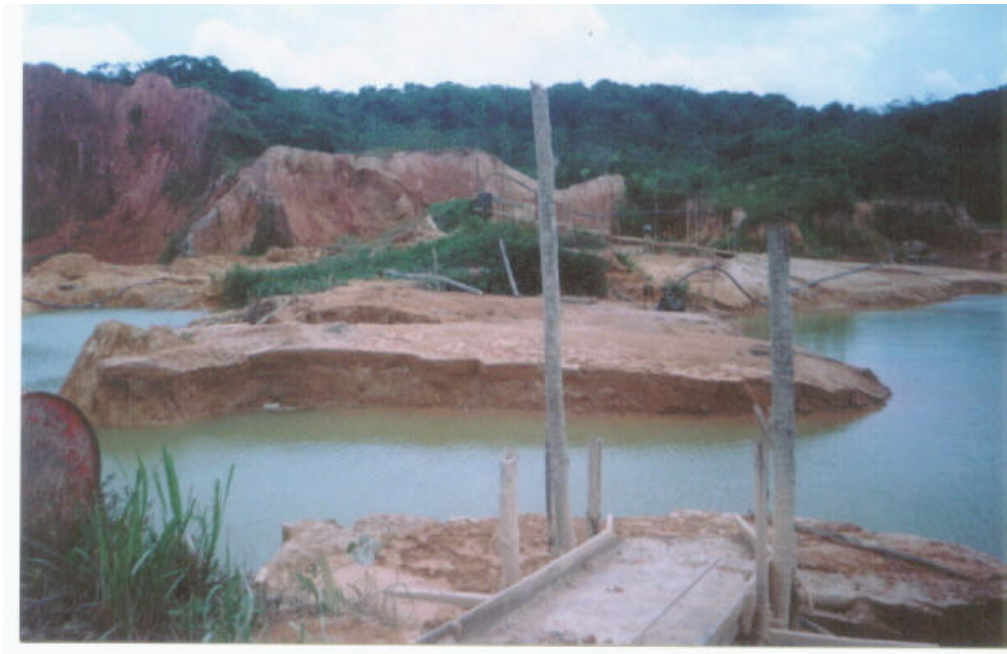
Picture 4-Waste of soil

The extractive activity in Caxias has left significant marks of environmental degradation, like destruction of organic layer (picture 4), formation of large craters and contamination of the liquid bodies with mercury. In some places the intense outwear of the soil becomes impracticable the recuperation of area to vegetation or agriculture.