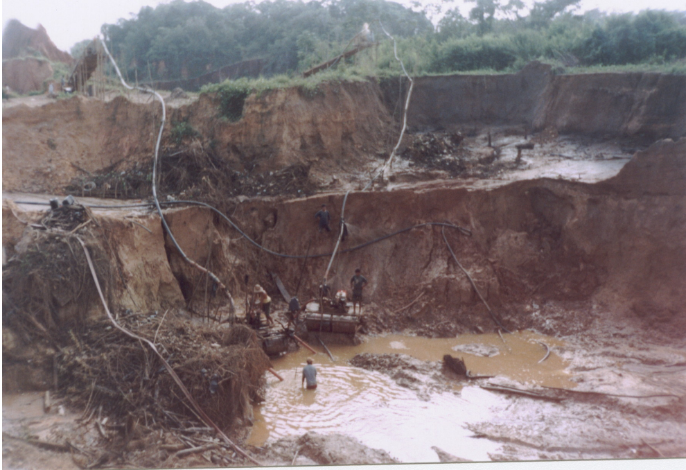
Picture 2- Mining activity