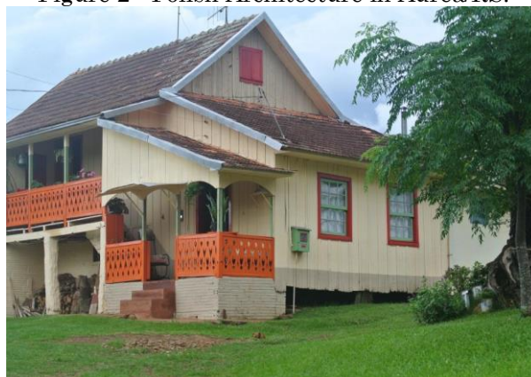
Figure 2 - Polish Architecture in Áurea/RS.

One of the main characteristics of the Polish buildings is the coloring of their façades, represented by warm colors, and, inside, a structure that borders on simplicity, reflecting the historical economic condition of the country, where its population was limited in relation to acquisition of goods (Figure 2).