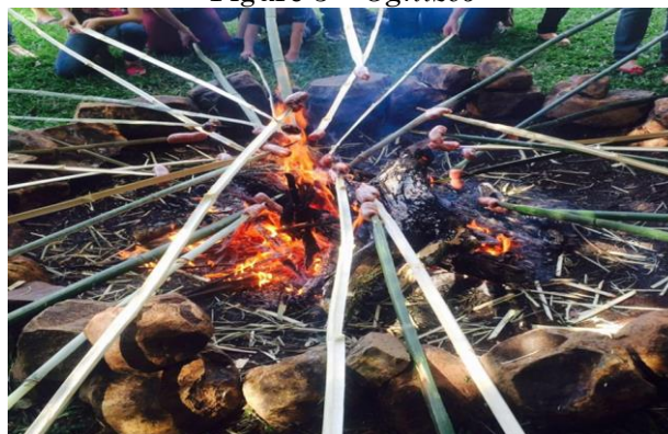
Figure 3 – Ognizco

barbecue and other gastronomic habits and traditions incorporated mainly from the influence of the indigenous and the gauchos.