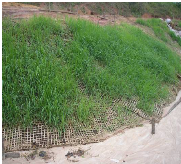
Figure 9: Grass development, one-month after rehabilitation, Sacavém community, SãoLuís, Brazil.

Textural data show that the main component materials of the slopes at Sacavém gully are sands, with many samples being >90% sand (Table 3). Thus, the soils are highly erodible and, therefore, the use of biological geotextiles is very important to arrest the erosion process.