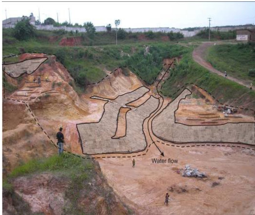
Figure 7: Continuous lines: areas rehabilitated with Buriti palm mats.

Hatched lines: the rehabilitated area in Sacavém Community, São Luís, Brazil.