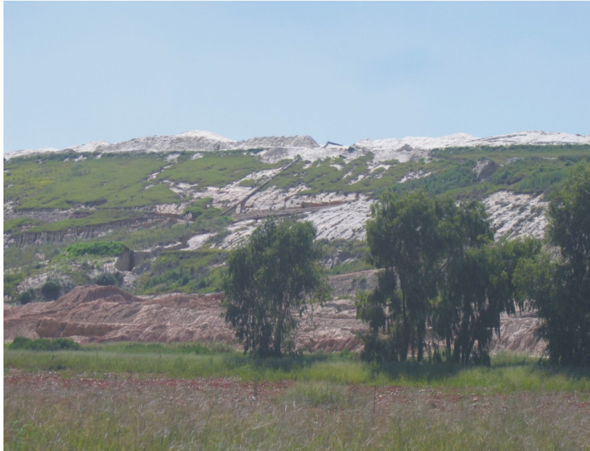
Figure 2: 'Mega-dump' of reprocessed gold tailings, south-east of Springs, Gauteng Province. Heavy rains in February 2008 led to landslides that denuded large parts of the previously vegetated slope.

The settlement of São Luís was established in 1612 and has evolved in distinct phases. Rapid urban