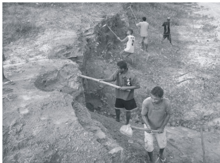
Figure 4: Men working with hand-held tools, São Luís, Brazil.