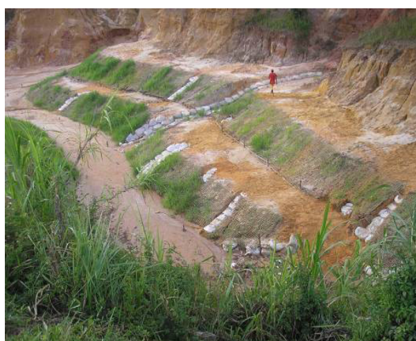
Figure 10: Maintenance work at the rehabilitated area one month after rehabilitation, Sacavém community, São Luís, Brazil.