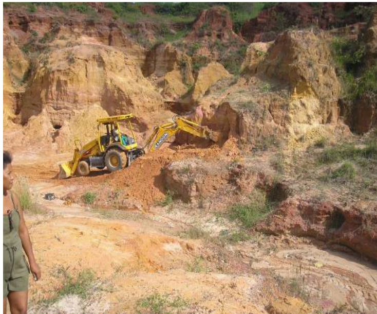
Figure 5: Initial work in areas 4-8.

The rehabilitation work in Sacavém was divided into three areas, presented in Figures 4 and 5, because of local relief characteristics. Areas 1-3 (Figure 6) were constructed with men and tractors; areas 4-8 (Figure 6) were made in the higher parts with a tractor; and areas E, M and D (Figure 3) were reshaped exclusively by manual labour.