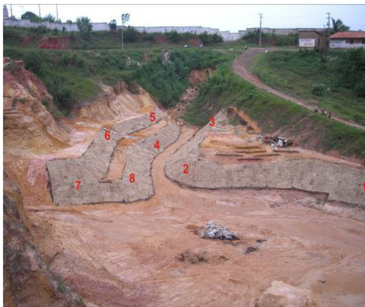
Figure 6: Rehabilitated areas with cover of buriti geotextiles, Sacavém Community, São Luís, Brazil (Areas 1-3 were constructed with men and tractors; areas 4-8 were made in the higher parts with a tractor).

In Part 1 (Figure 6: areas 1-3) the team used biological geotextiles and organic matter from decomposing palms, seeds and inserted barriers of wooden stakes along contour lines. This area had formed due the concentration of runoff from the street above the gully (Figure 7).