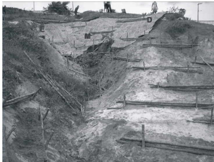
Figure 3: Area 3 of the rehabilitated area, with work in progress. E, M and D were reshaped exclusively by manual labour, São Luís, Brazil.

caesalpiniae folia ) was used on the higher parts of the gully, to protect the topsoil. The rehabilitated area was fertilized with 500 kg ha -1 of NPK (4-14-8) and decomposing palm was added to topsoil, as a source of organic matter. The project employed 10 local men for six days, who conducted the work using hand-held tools (Figure 4). A tractor (type backhoe loader) was used for two days to construct the terraces (Figure 5).