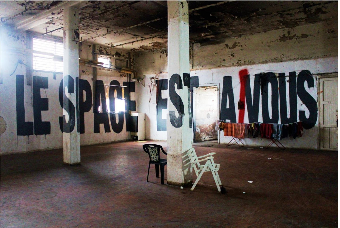
Mural in a plaza inside a building of the Metropoliz okupa in Rome, 2014.

questions have become a leading concern of artists everywhere.