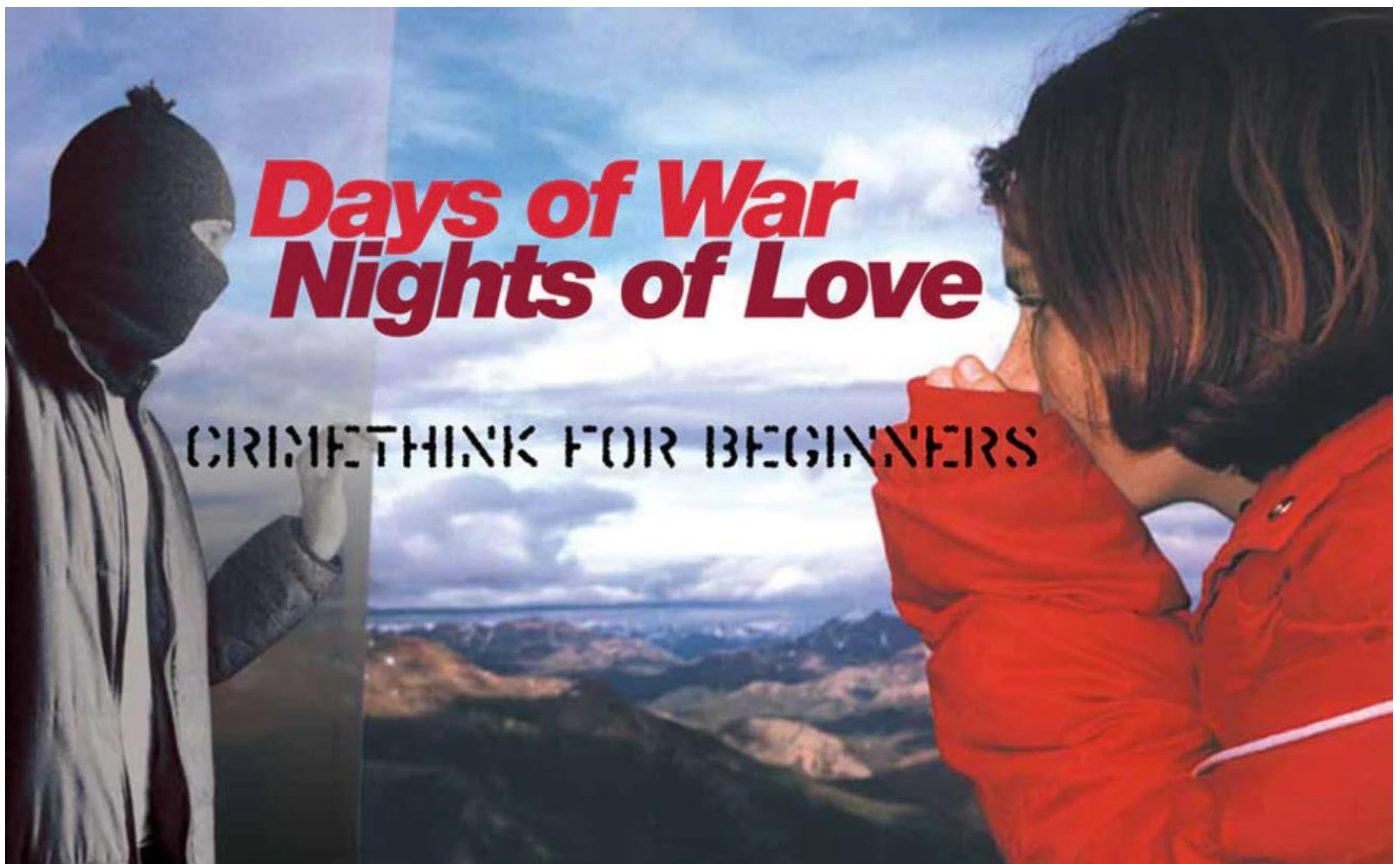
Crimethinc, cover of Days of War Nights of Love Crimethink For Beginners (2001).

Two more lines of thought bear on squat culture, and probably more directly than academic frames of political theory and cultural studies. The radical anarchist discourse of the Crimethinc Ex-Workers Collective in North America, closely connected to the hardcore punk music scene, was influential in the life-style anarchism of nomadic crust punks. [Crimethinc, 2001] The CWC website has matured, and continues to post in-depth analyses and historical articles on anarchist and riotous actions, including those of the Black Lives Matter uprising and many Latin American struggles. More recent projects like IGD.org (It's Going Down) have joined Crimethinc and the Institute of Anarchist Studies in a lively Anglophone anarchist infosphere, together with extensive European platforms.