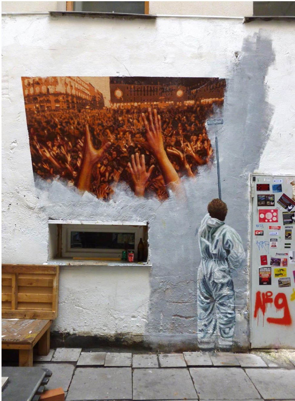
Artist unknown, mural in the courtyard of Centro Social Okupado Autogestionado Casablanca, Madrid (desalojado 2012) the photo in the mural shows the 15M assembly in Puerta del Sol. ( 15mpedia.org/wiki/CSOA_Casablanca ).