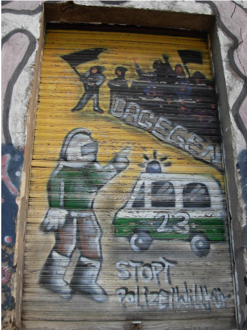
Mural on an evicted squat, Berlin, 2011.