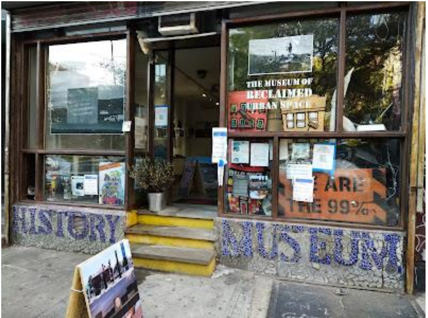
The Museum of Reclaimed Urban Space (MoRUS) in NYC, an autonomous project dedicated to squats, community gardens, and bicycle activism