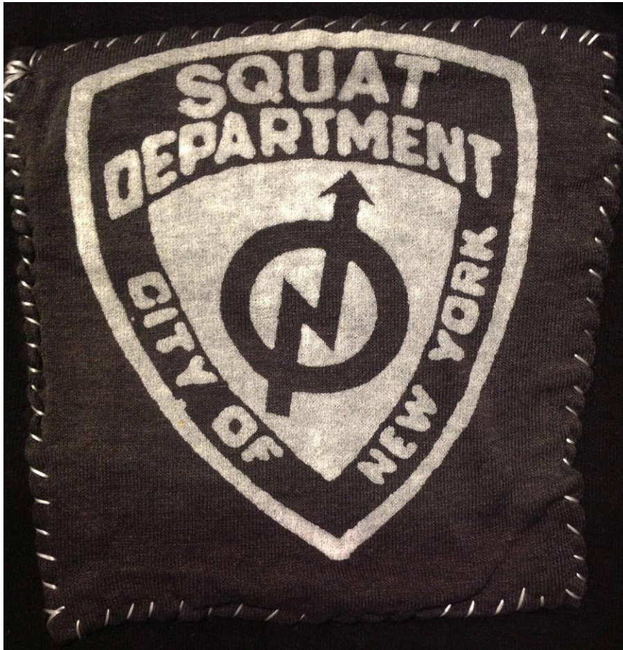
Shoulder patch produced by MoRUS workers