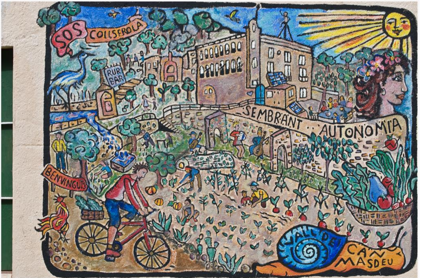
Mural at Can Masdeu, Barcelona, 2012. This okupa is a former hospital with extensive gardens for both the commune of occupiers and neighbors

More broadly, extra-legal spaces are continuously involved in performance activities, from the execution of street demonstration tactics and squat defense – performance for police and media – to the everyday. Squatters and their guests perform or pose for photographs and videos which stage the public image of the squat when mounted on the squat website or posted to social media. Some of these performances can be dramatic and spectacular, such as the acrobatic lockdowns at Can Masdeu during the 2002 eviction attempt. The lockdown in defense of ABC No Rio in New York in the late 1990s became an element in a painted sculpture by Seth Tobocman which depicts a seated protestor, her neck secured to a building with a bicycle lock, being approached by a policeman.