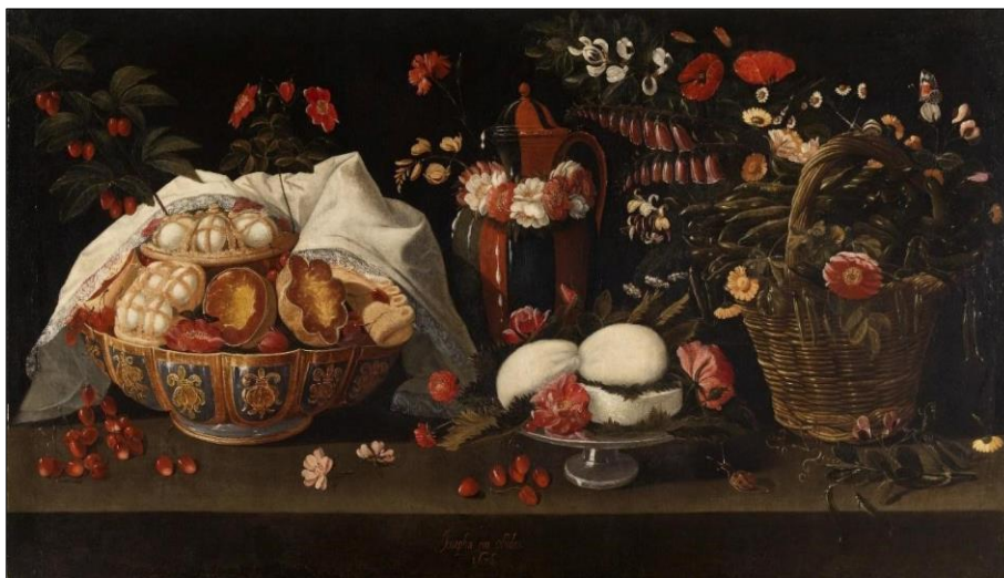
Figure 2 – “Still-Life with Sweets and Flowers”; Oil painting; 85 cm x 160.5 cm; The Anselmo Braamcamp Freire Santarém Public Library; Josefa de Óbidos, 1676.

Source: Serrão, Vitor (1991): 205. Josefa de Óbidos and the Baroque period. Lisbon, TLP – The Portuguese Institute of Cultural Heritage.