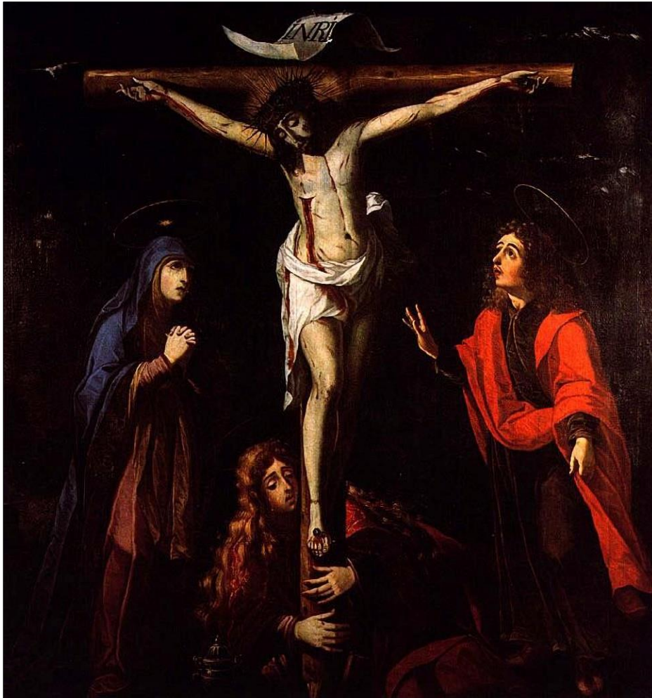
Figure 4 – “Calvary”; Oil Painting; 160 cm x 174 cm; The Holy House of Mercy of Peniche; Josefa de Óbidos, 1679.

Source: Serrão, Vitor (1991): 222. Josefa de Óbidos and the Baroque period. Lisbon, TLP - The Portuguese Institute of Cultural Heritage.