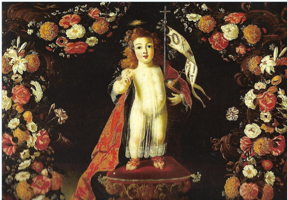
Figure 1 – Baby Jesus, Savior of the World; Oil painting; 95 cm x 116.5 cm; Mother Church of Cascais; Josefa de Óbidos, 1673.