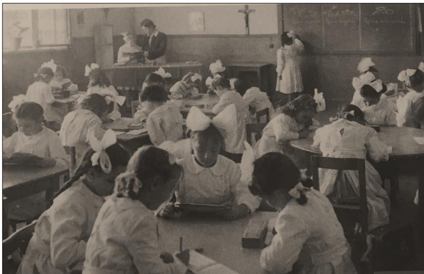
Photo II. Personalised work school session. Father Poveda School.