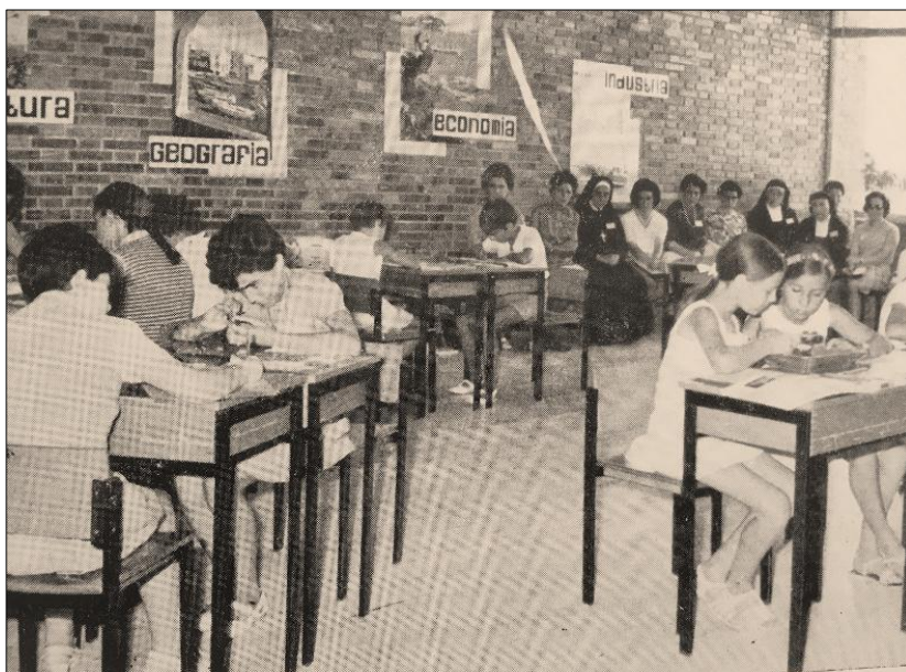
Photo I. Picture of teachers participating in teacher improvement training courses at Veritas Institute 7 .

A large number of Church and public schools joined this movement. This initiative sought to disseminate personalised teaching through Experience and studies seminars aimed at training of teachers and school managers. Irene Gutiérrez mentions some of the activities that took place in this pilot centre: "the visits and stays of teachers in the renovated centres, mainly in Somosaguas, the supervision of the centres themselves, the school and teacher training materials created, the conferences and talks" (2009: 188).