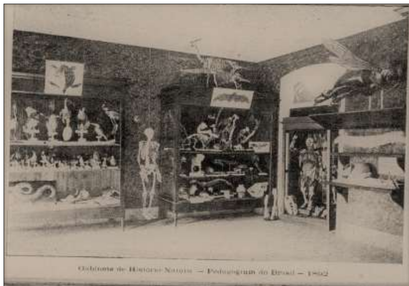
Figure 1: Natural History Cabinet of Pedagogium