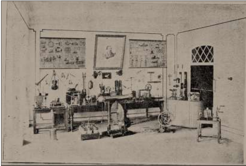
Figure 2: Pedagogium's Physics Cabinet