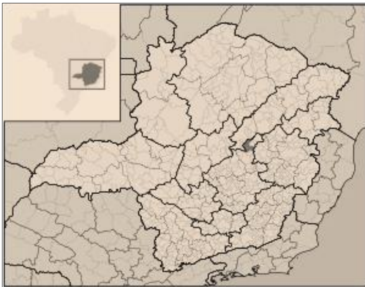
Figure 1- Map of the location of Serro in the state of Minas Gerais and Brazil

Body hygiene. Hygiene of the soul. Two basic principles for civilized, peaceful, progressive, and modern social coexistence. Two principles adopted by the social institutions of public government in the city of Serro, Minas Gerais, Brazil, since the second half of the 19th century.