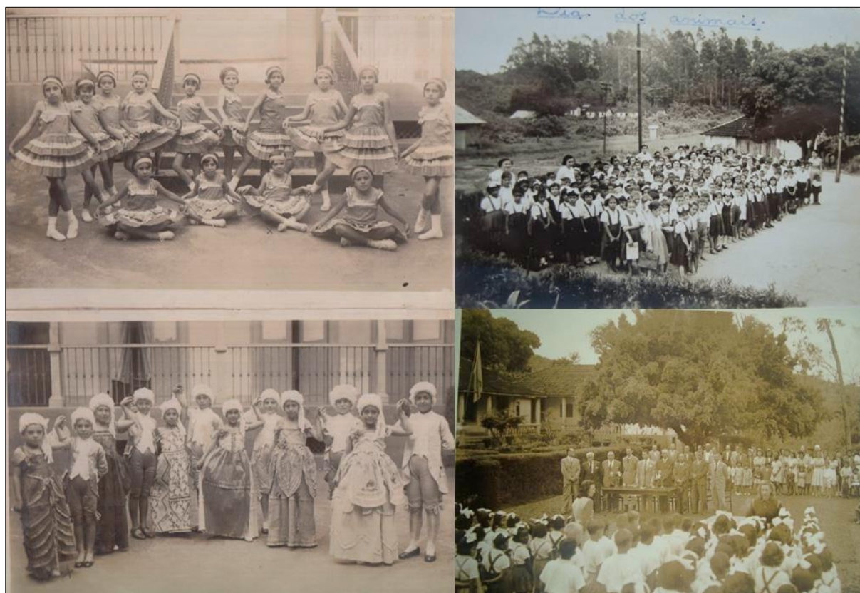
Figura 16- School celebrations in the school region of Santos 21