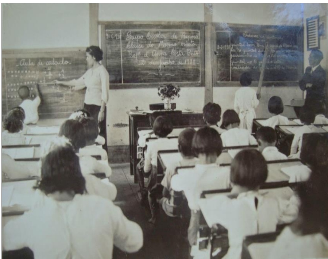
Picture 11 – 1 st grade mixed, of Graded Primary School of Raposa, 1938.