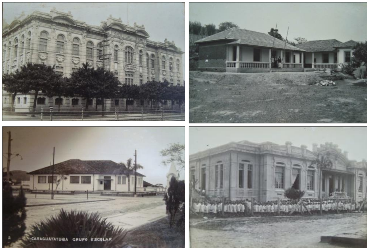
Figura 9 – Facades of graded primary schools building of the school region of Santos. 16