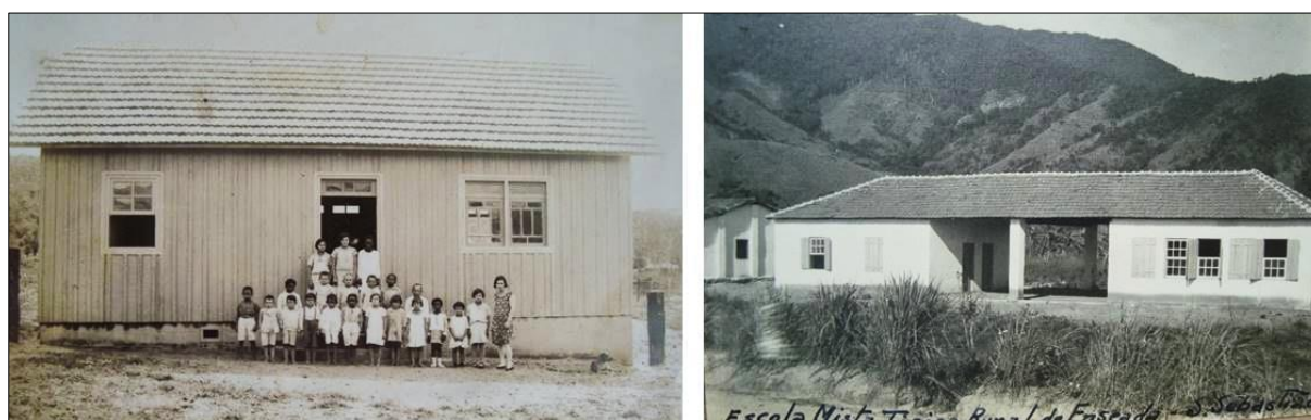
Figure 10- Facades of rural primary schools of the school region of Santos (Rural Primary School of Piratininga, 1930, and Standard Rural Primary Mixed School of Enseada, São Sebastião, 1950).