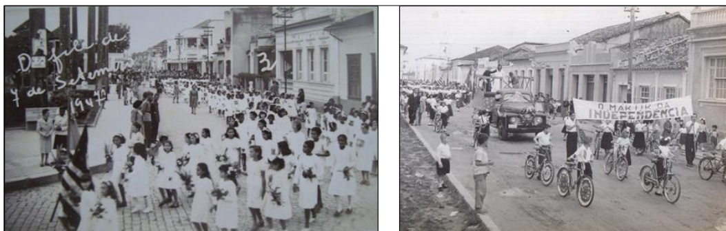
Figura 17 – Civic Parades – September 7