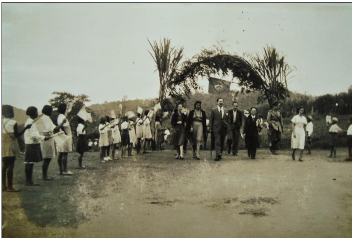
Figura 15- Visit of the interventor Adhemar de Barros to the SG of Cananéia, in Jun, 1940.