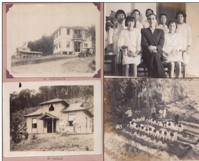
Picture 5 - The residence of Japanese in the Vale do Ribeira and students of the S.G. of Raposa, Registro, 1938