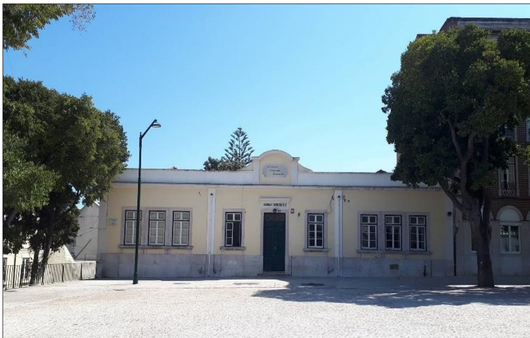
Fig. 1 | Facade of building Escola Oficina n.º 1 in Largo da Graça , Lisbon

The legacy of this institution is constituted by a significant archive, bibliographic, material and iconographic heritage, which enable us to establish its itinerary, to understand its main educational agents and to reconstitute its internal functioning. The building itself is a symbol of this heritage and has preserved the inscriptions of the time of the Republic on its facade, thus conferring visibility and meaning to the space which, today, represents an educational memory.