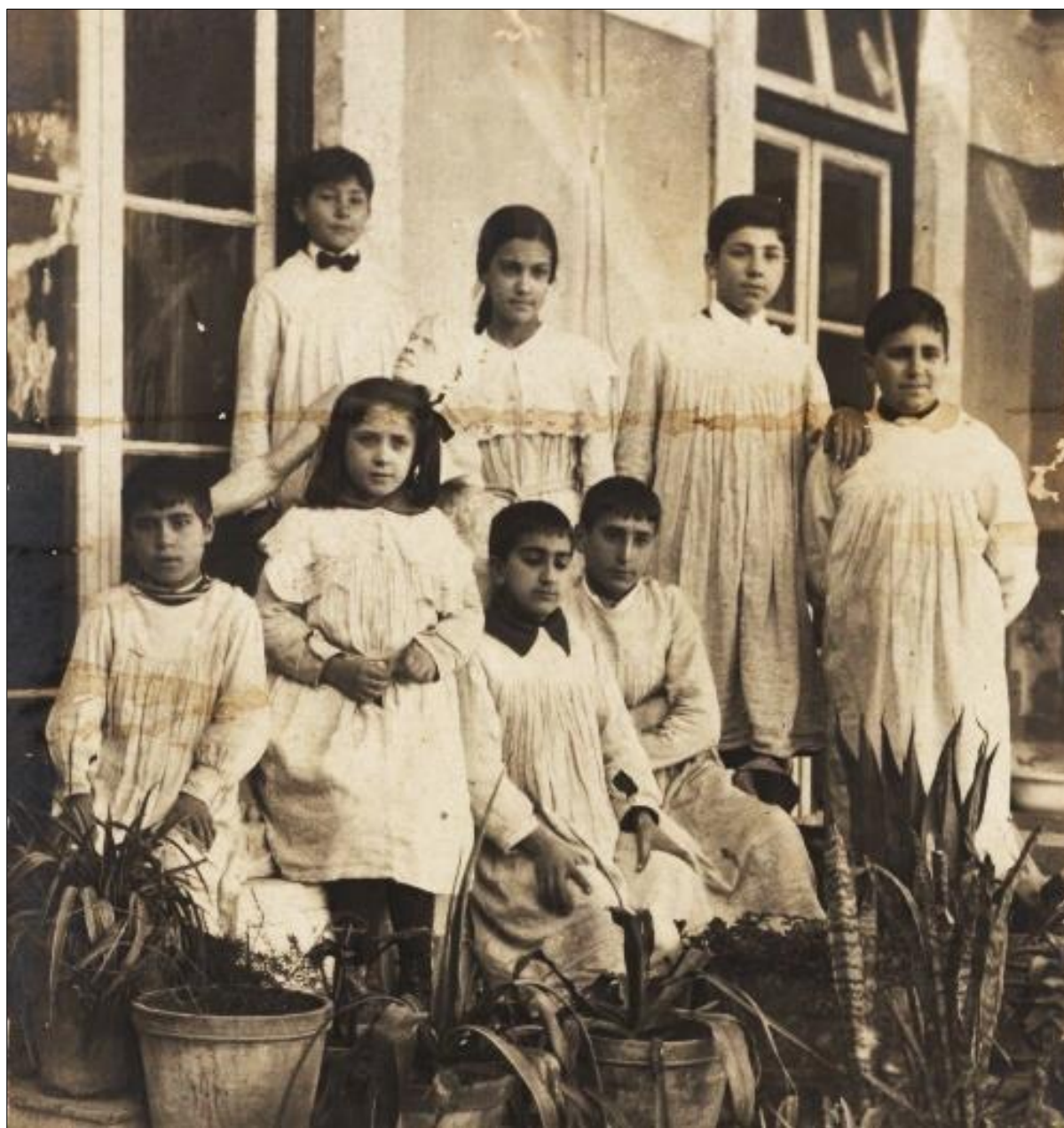
Fig. 18 | The Directive Committee of «A Solidária» for the year 1916