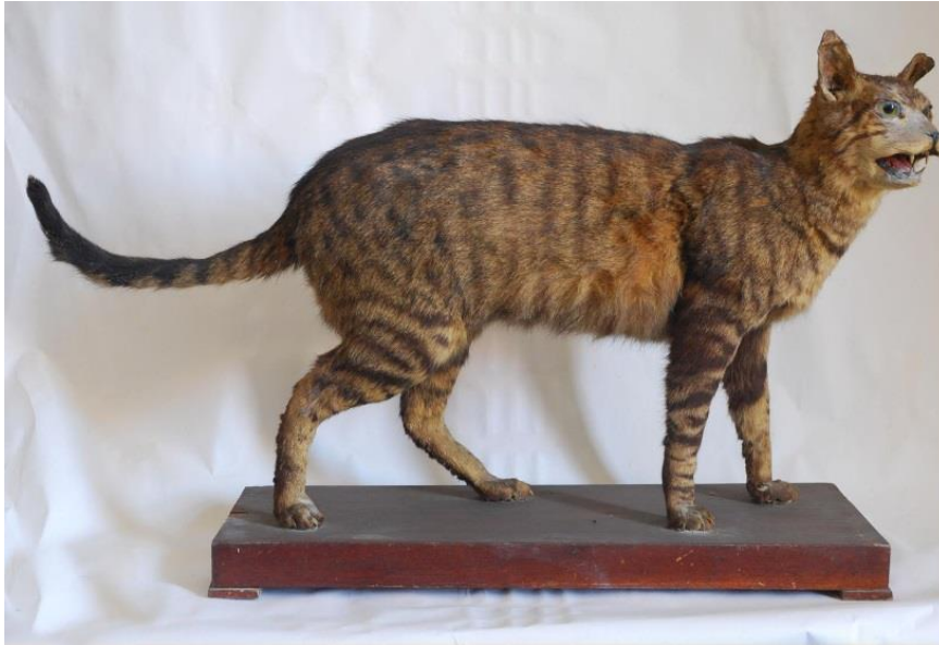
Fig. 12 | A naturalised animal