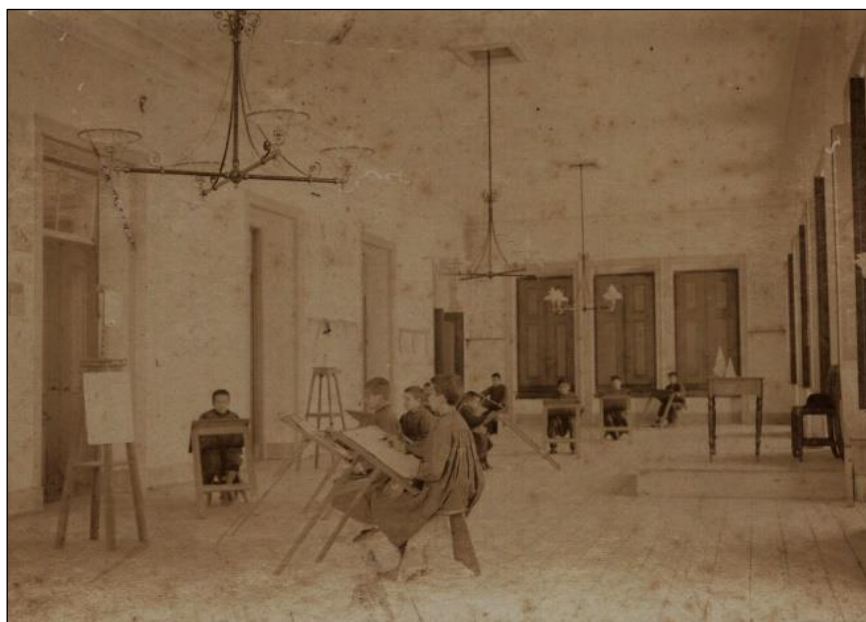
Fig. 2 | Design and drawing room, 1906-1907

Source: Arquivo Nacional da Torre do Tombo