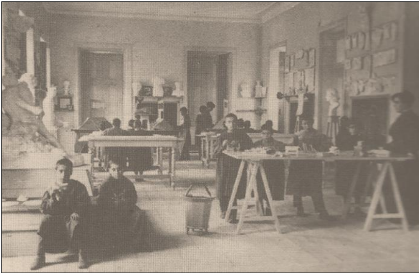
Fig. 3 | Design and drawing room from another angle, photo taken between 1907-1912