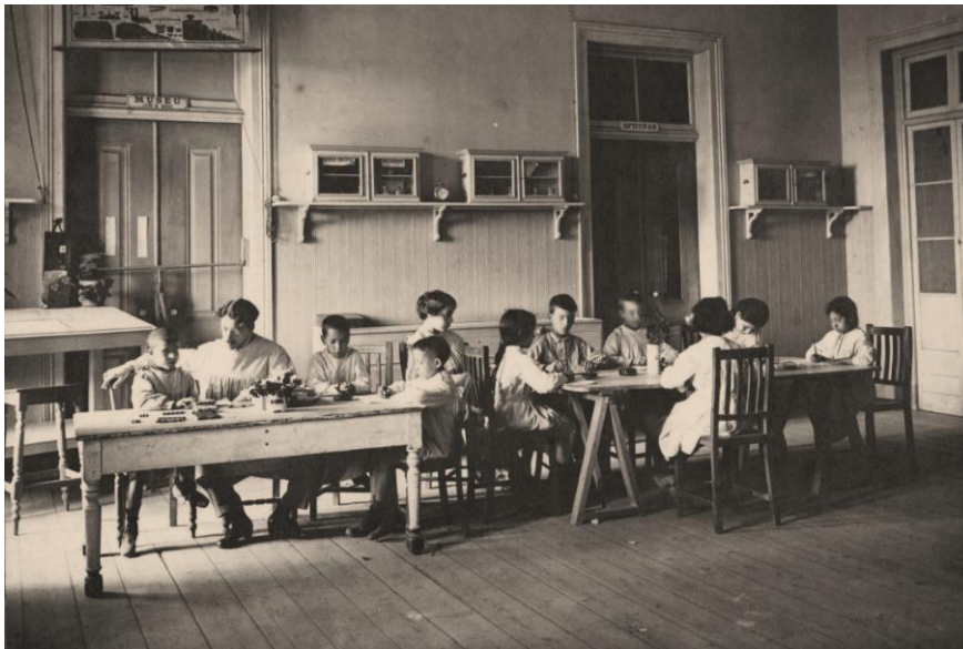
Fig. 6 | Previous classroom after 1912