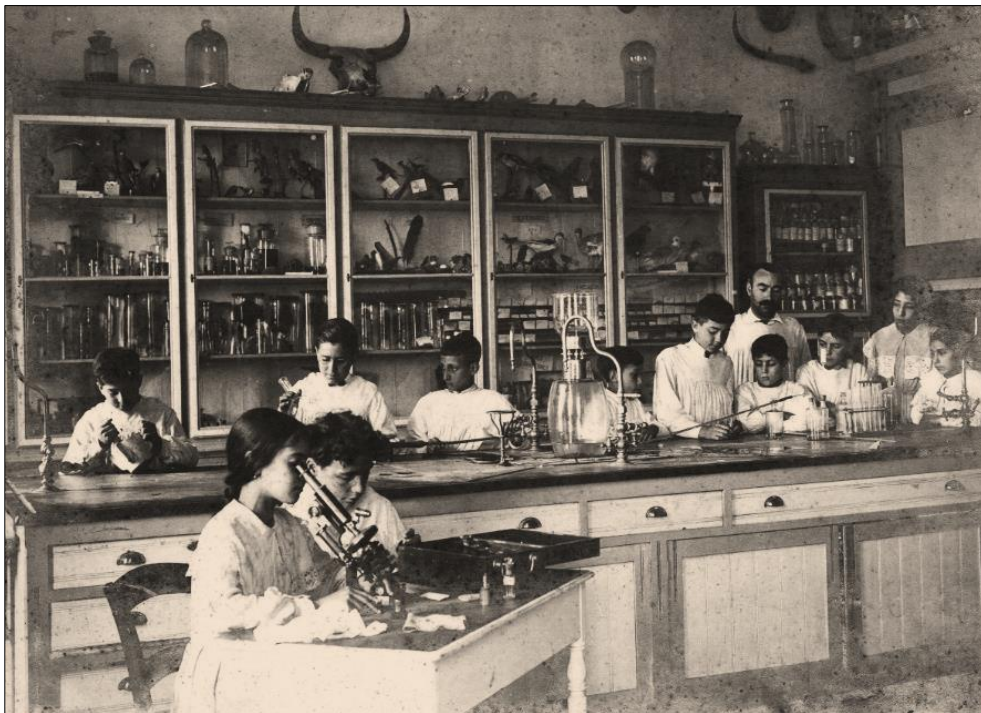
Fig. 8 | Museum laboratory, after 1912