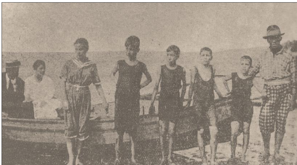
Fig. 19 | Group of swimmers of «A Solidária»