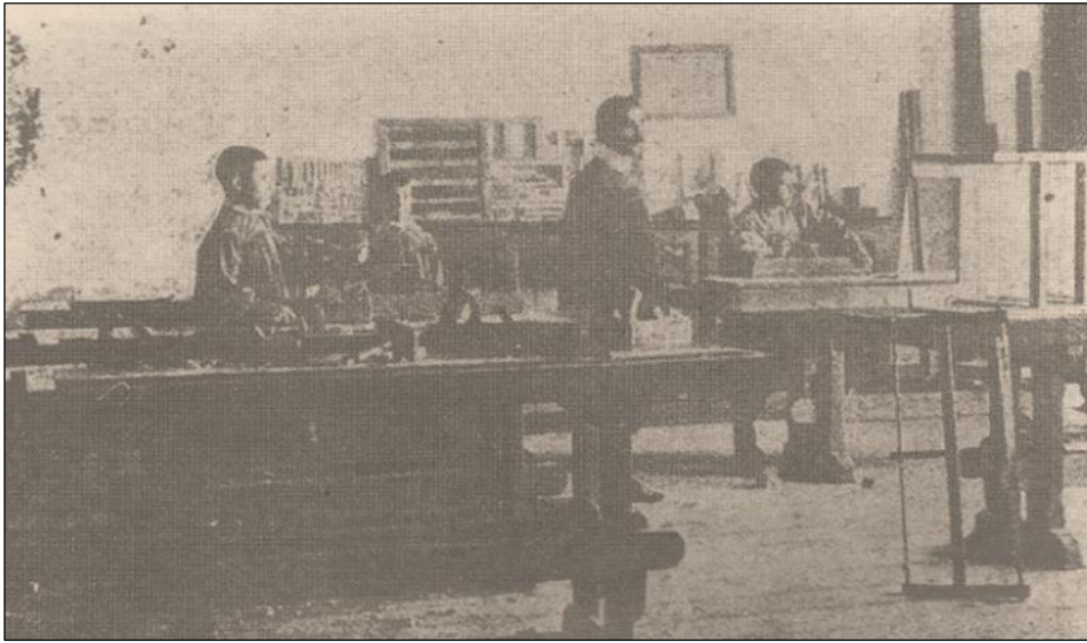
Fig. 9 | Joinery class between 1905 and 1912