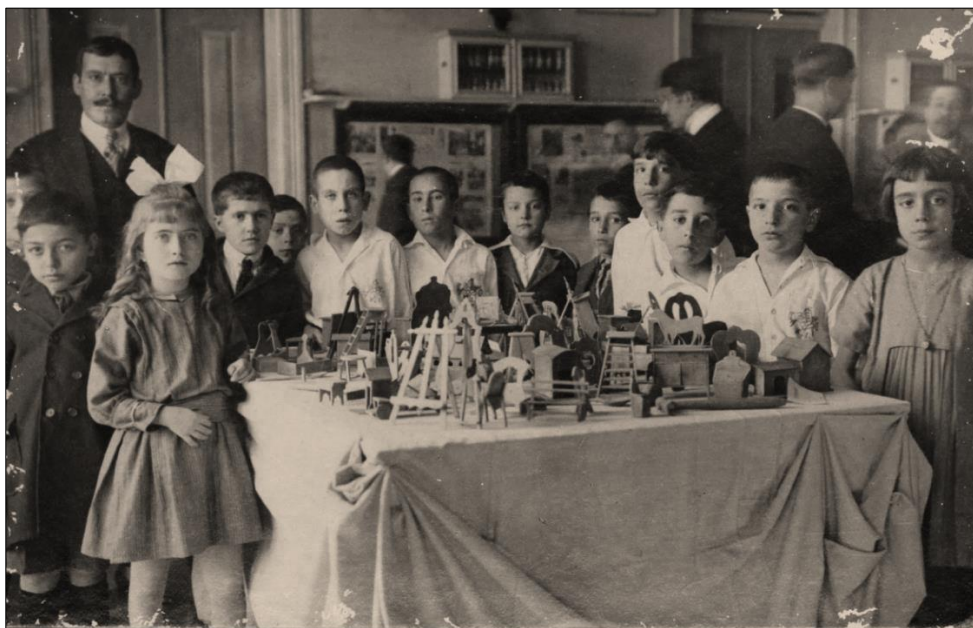
Fig. 11 | Exhibition of pupils' works at the end of the academic year