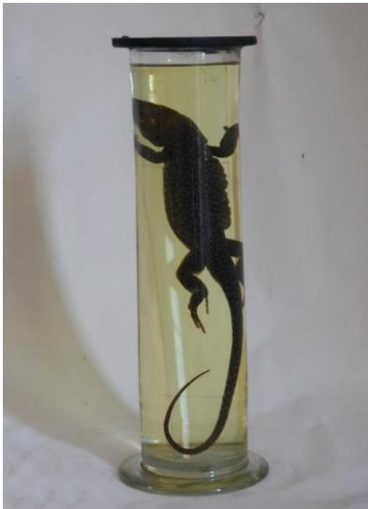
Fig. 13 | Specimen of an animal preserved in a jar with liquid