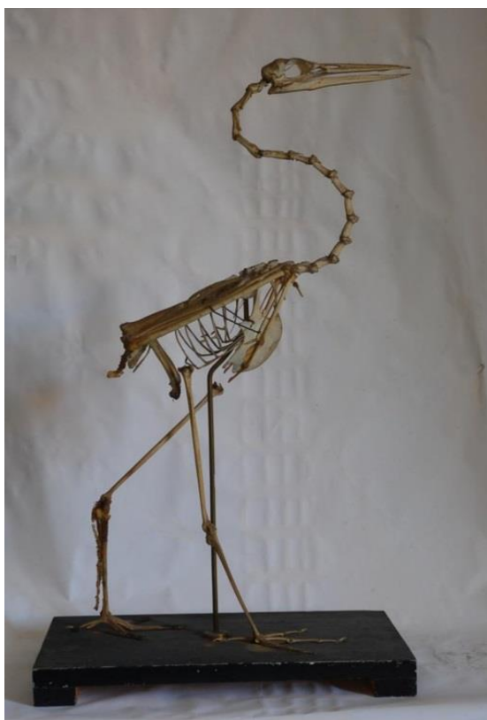
Fig. 14 | Animal skeleton specimen