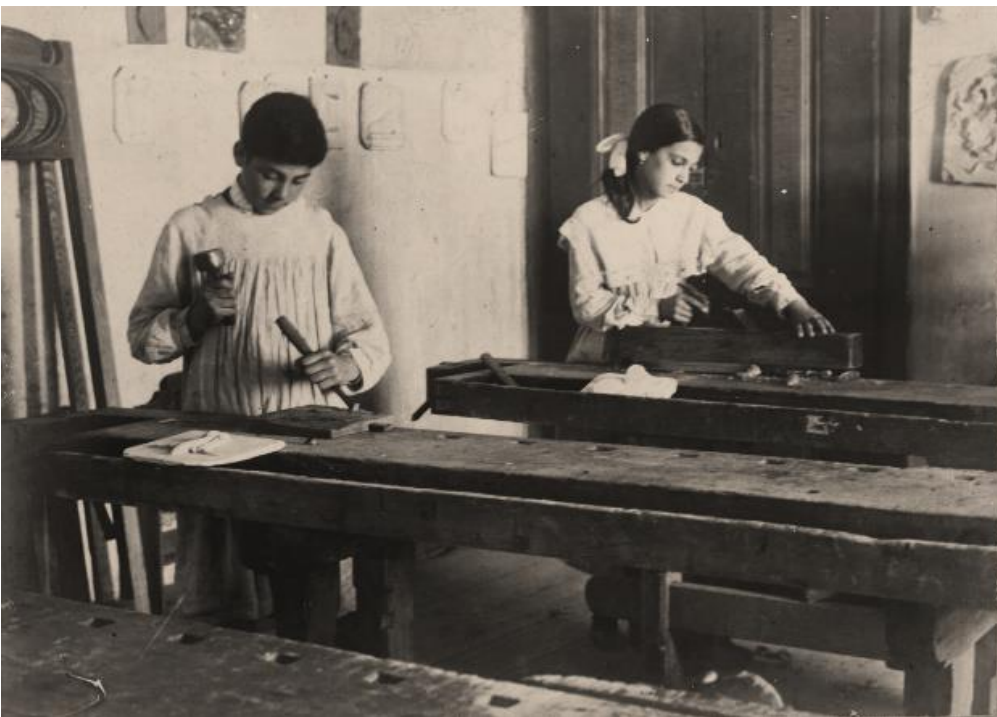
Fig. 10 | Joinery class after 1912

Design and drawing room: Arquivo Nacional da Torre do Tombo