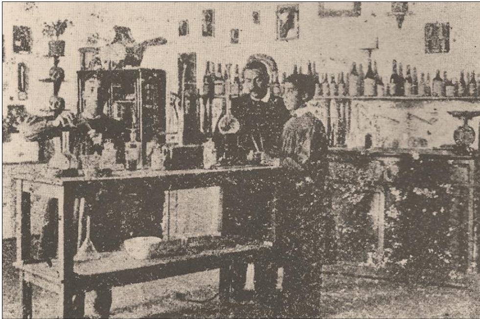
Fig. 7 | Chemistry class, between 1907 and 1912