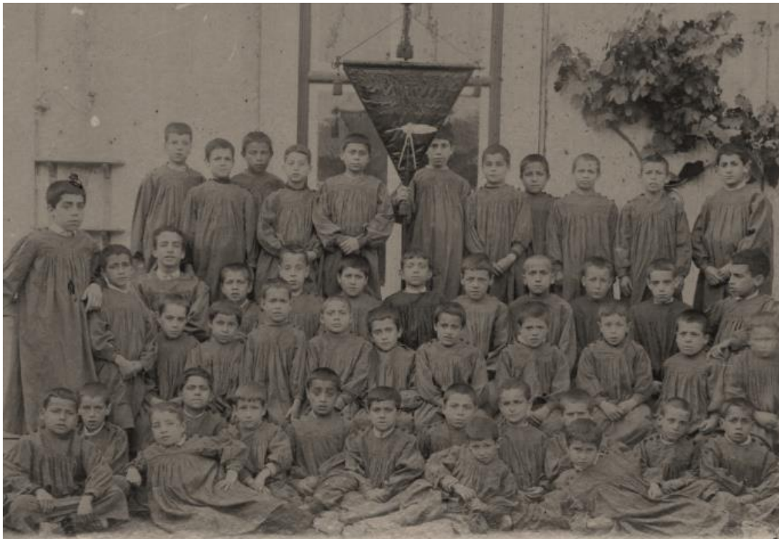
Fig. 16 | Group of pupils from the Escola Oficina n.º 1, between 1906 and 1912