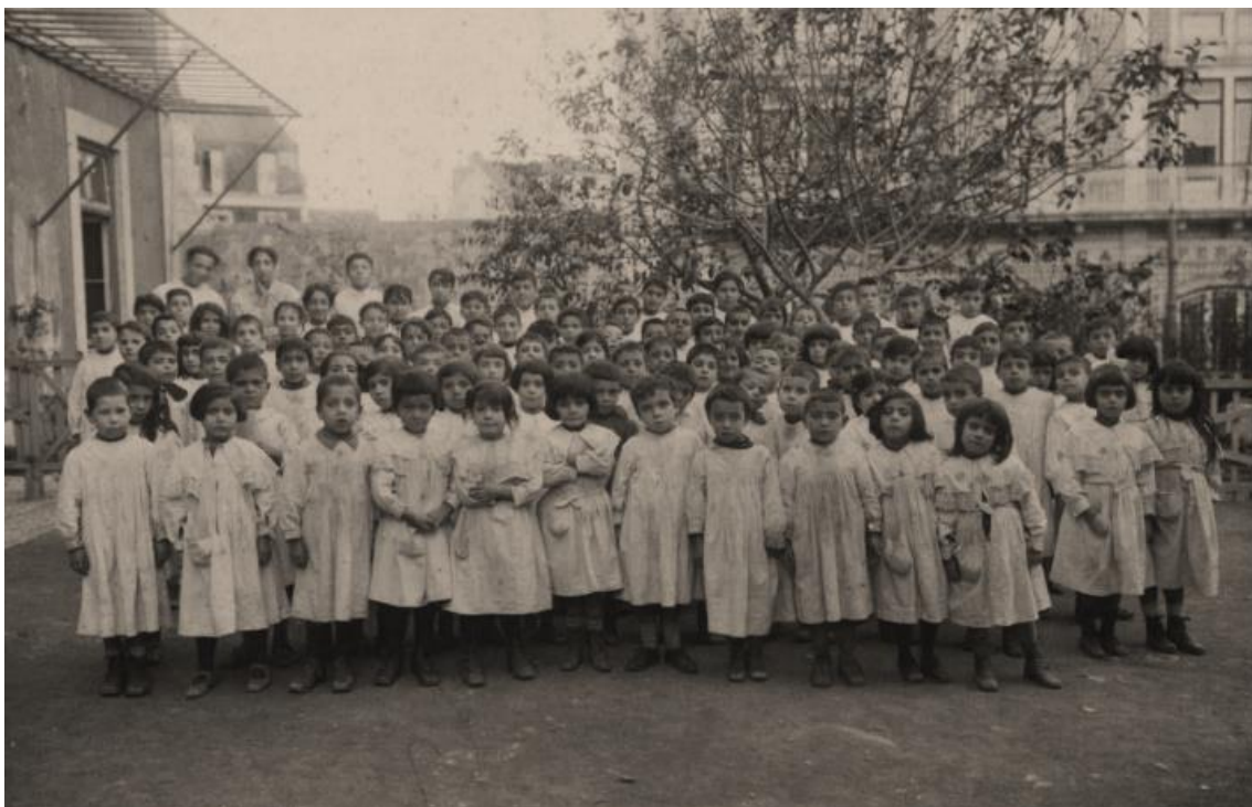
Fig. 17 | Group of pupils from the Escola Oficina n.º 1, after 1912