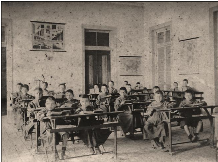
Fig. 4 | Classroom typical of the dominant pedagogical conceptions in this school between 1905-1907