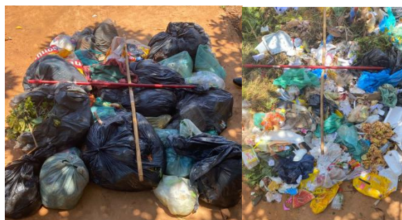
Figure 2 - Quartering performed with the initial sample