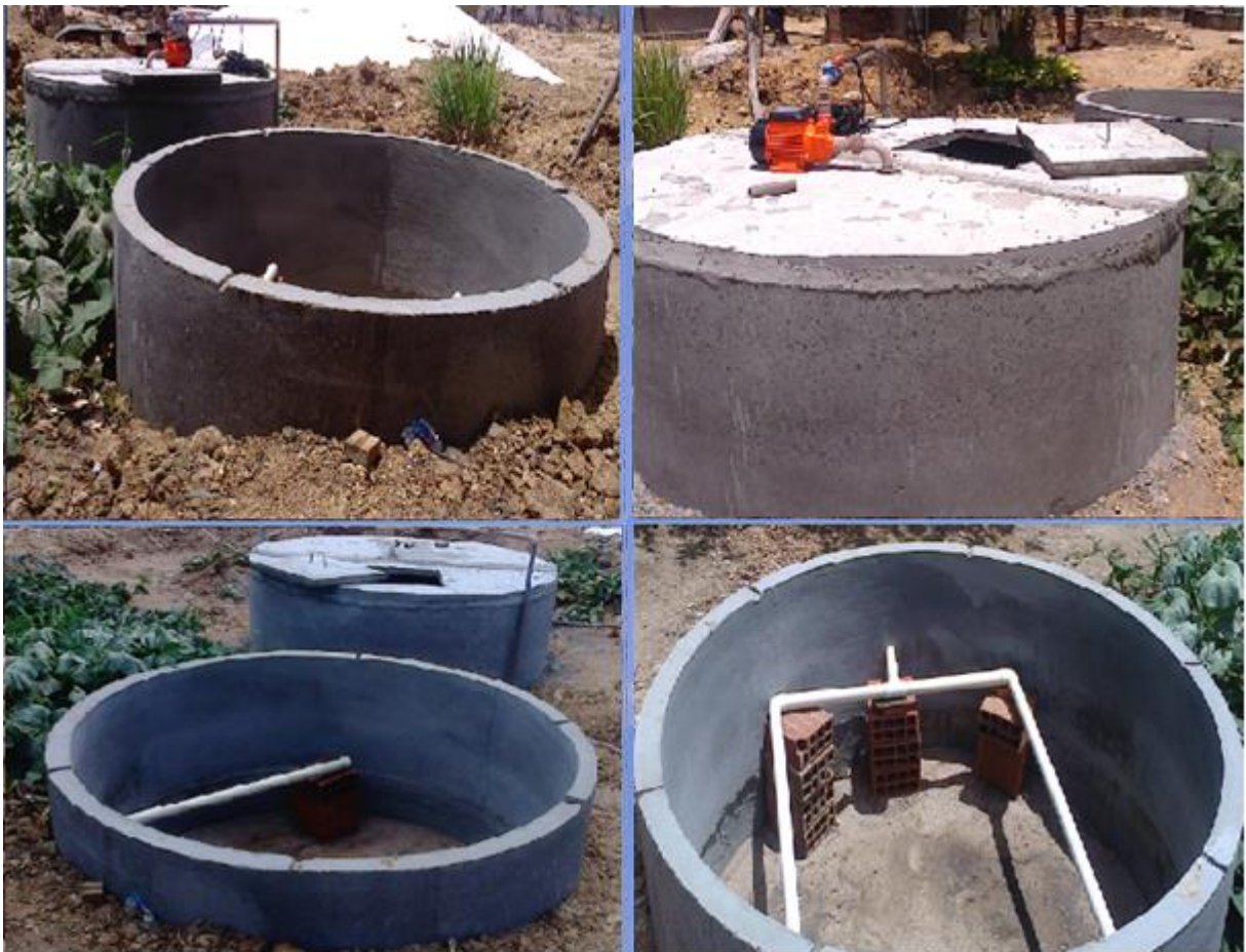
Figure 3 – Biohazards installed in rural communities in the municipality of Pedra Lavrada-PB.

At first, in the rural area of the municipality of Pedra Lavrada-PB, the construction of bio-waters (Figure 3) was identified in local communities that coexist with periodic water shortages.