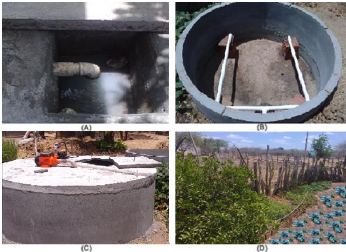
Figure 4 – System of use of the bio-water installed in the city of Pedra Lavrada-PB.

With the use of the bio-water, a daily production of 120 liters was obtained, which allowed the drip irrigation of several local crops: coconut and orange plantations, vegetables, lettuce, herbs, and palm feedingstuffs.