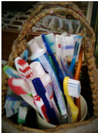
Figure 1. Unsafe storage of tooth brushes and paste in a single container

After the TCA was signed, the NH was inspected by technical assistants (dentists) two more times at roughly 45-day intervals. The new assessments again found poor oral hygiene evidenced by food debris on the dentures, partly disagreeing with the proposed protocol. Some protocol items were re-explained to the caregivers. But improvements were also noticed, such as better storage of dentures, and tooth brushes and paste (Figure 2, A and B), and individual daily records of oral events (Figure 2, C).