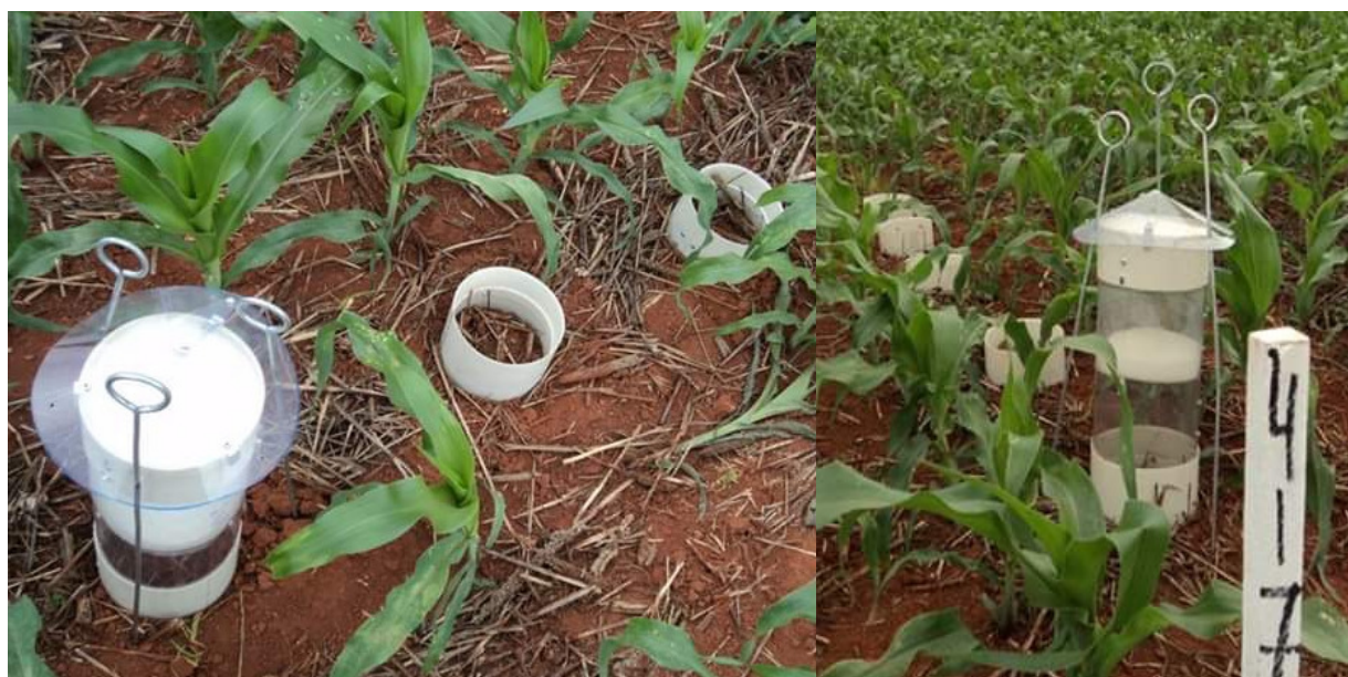
Figure 2. Semi-open static collector with absorber wrapped foam and its respective PVC bases use to quantify ammonia volatilization in maize crop field.

The samples were collected from the semi-open collectors in different monitoring time for ammonia quantification. The foams located at the top of the collector were discarded. Foam located in the center of collectors (figure 2) collected and used for analysis. The foam disks were stored in plastic bags and refrigerated to a temperature of less than 5 °C for later quantification of volatilized N.