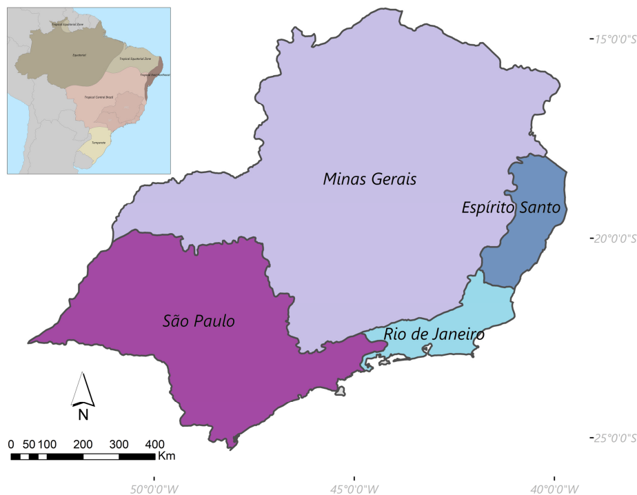
Figure 1. Location and states that make up the Southeast region of Brazil.

The Southeast region of Brazil occupies approximately 924 620 km 2 , being the most populous of Brazil with 85 million people. It is composed of four states: Espírito Santo, Minas Gerais, Rio de Janeiro and São Paulo (Figure 1). The relief is quite bumpy, with a predominance of plateaus. The climate is tropical, between hot and temperate, with large local variations. SUS Department of Informatics (Unified Health System) from Brazil provided the data of reported dengue cases in the Southeastern region of Brazil of the time series from 1994-2014 (DATASUS, 2015).