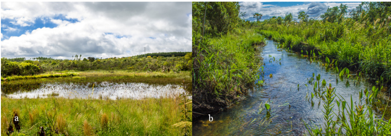
Figure 1 - Study area. The pond (a) and the stream (b), as examples of lentic and lotic habitats.

The study was conducted in palm swamp habitats within the Ecological Reserve of the Clube de Caça e Pesca Itororó de Uberlândia (CCPIU), in the state of Minas Gerais, southeastern Brazil (18°59'00" S, 48°18'00" W). The climate is Tropical wet and dry (AW) according to the Köppen climate classification and its elevation is 880 m above the sea level. There is a large wetland area with an associated pond (Figure 1 a), one stream (Figure 1 b) and temporary pools. Although the Ecological Reserve limits comprise 640 ha, the pond (lentic) area is about 60 square meters and the stream (lotic) length is about 500 meters (Figure 1).