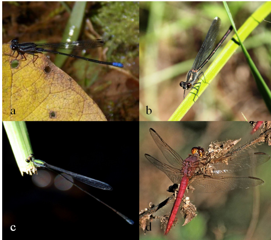
Figure 3. Rare species that occur in the studied Brazilian palm swamp. A - Argia smithiana ; B - Mnesarete lencionii (female); C - Epipleoneura williamsoni ; D - Orthemis aequilibris

In this context, the study area seems to be a hotspot of rare and threatened species, such as Cyanallagma ferenigrum , Homeoura chelifera , Minagrion waltheri , Mnesarete lencionii and Orthemis aequilibris (Figure 5) all of them recorded for the first time in Minas Gerais state in this study, with the exception of the latter (Heckman, 2008). Moreover, a new species of the genus Erythrodiplax (Libellulidae) inhabits this area and is being described.