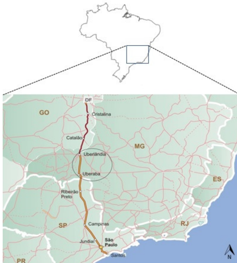
Figure 1. Location of the BR-050 highway, especially the section investigated, between the municipalities of Uberlândia and Uberaba (in the circle).

The BR-050 highway extends through more than 1,000 km, from Brasília (Federal District) to the State of São Paulo (SP-330), passing through the States of Goiás and Minas Gerais. The stretch investigated is located between the cities of Uberlândia and Uberaba, Minas Gerais, with 96 km of highway duplicated in both directions (Figure 1). On average, 12,000 vehicles pass daily on this stretch of the highway (SEDET, 2009).